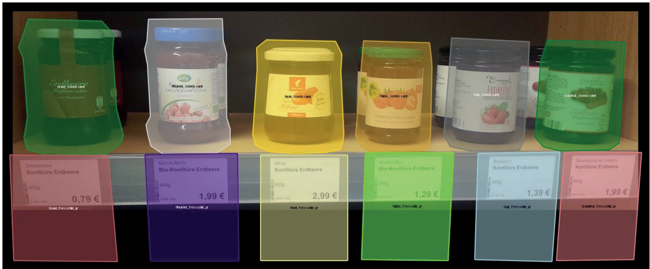
Figure 1: Areas of interest for the front view of the strawberry jams

consideration and was removed from the final data sample under analysis. To judge the data quality, the videos of all participants were checked for drift, i.e. imprecise gaze locations, and for gaps between gaze points indicating erroneous recording of the eye movements or faulty aggregation of gaze points by the inbuilt algorithm. Two researchers each independently judged the quality for one half of the participants. 20 videos were checked by both researchers with an intercoder reliability of Kappa 0.82 (SE 0.071) which is a very good result (McHugh, 2012).