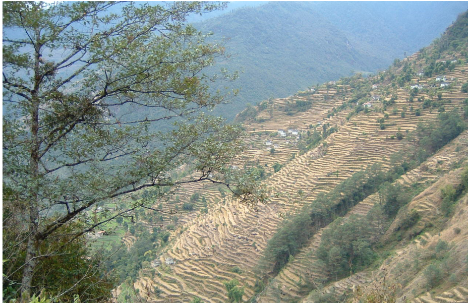
Picture 1. Village of Phuleli in survey area.

household is 12 but the range varies from four to 26 plots per household. However, only 41% of respondents were able to give details of their land holdings in ropani (system of land measurement in Nepal – one ha = 19.7 ropani). For these, the average holding per respondent was 50.5 ropani or 2.6 ha, twice that for the mountain ecological region of Nepal, and the average number of plots per ha was five, which is more typical of the region. An estimated Gini coefficient of 0.33 for respondent households, compared with that for Nepal overall of 0.54, reflects a relatively more equal distribution of land. However the plots are fragmented and discontinuous. The location of the furthest plots is often quite far from the dwelling house, an average of up to two hours walk away.