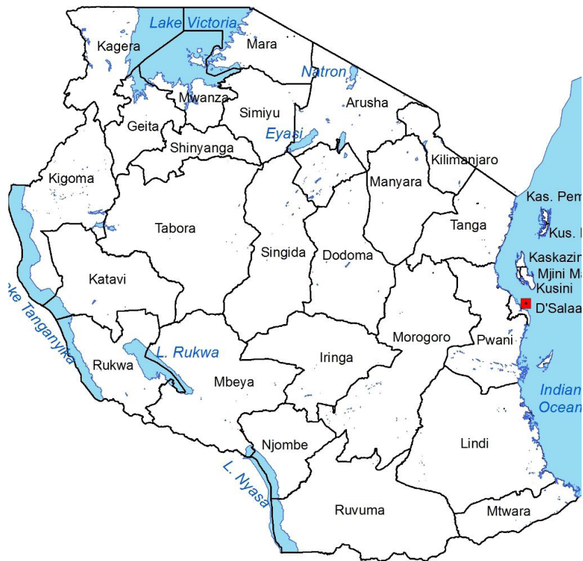
Figure 1 : The regions are Kilimanjaro (North), Mbeya (south) and Zanzibar (on the left of the map) both Unguja and Pemba

In the current trade regime, GIs are confronted in quality forums with new social concerns and values, from biodiversity to food security. As per the FAO (2009) it explains how GIs determine and influence food security by providing better income for producers and creating better economic access to food. GIs generate local economic benefits through greater market access and equity in international trade, thereby improving conditions for small and local farmers to sell their products and buy their necessities (Dagne, 2012). GIs “contribute to food security in rural areas, as far as they are considered and implemented as a rural development tool, and not only a commercial or legal one (Petrics and Eberlin, 2009). GIs have the potential as an economic policy instrument in helping to transform the Tanzania agriculture-dependent economy through exploiting the unique attributes of their quality products namely aroma, taste and colour. Tanzania has already demonstrated the capacity to tap into the organic world market. Therefore protecting Tanzania’s unique agricultural products using GI could lead to higher value-added products through product differentiation based on quality, providing consumers with certified information regarding product