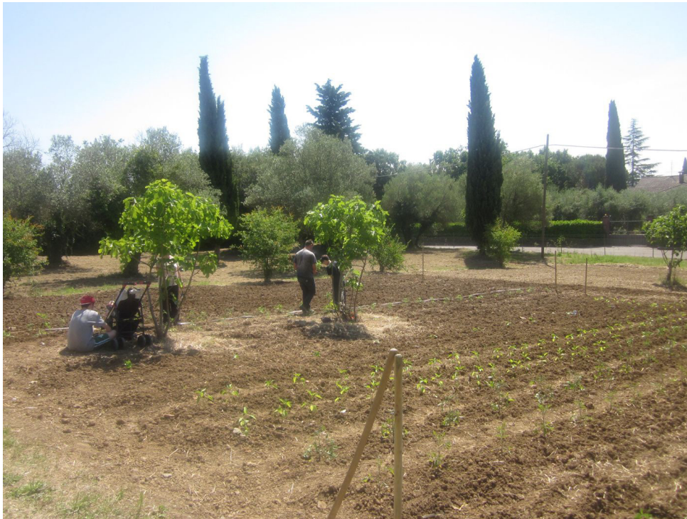
Figure 2: The project in the Elaia Farm

one was assigned to a person with psycho-physical disabilities. In the Santa Margherita area, there were 106 lots, with 5 unoccupied. In total, there were 309 lots, slightly less than the initial 340 lots.