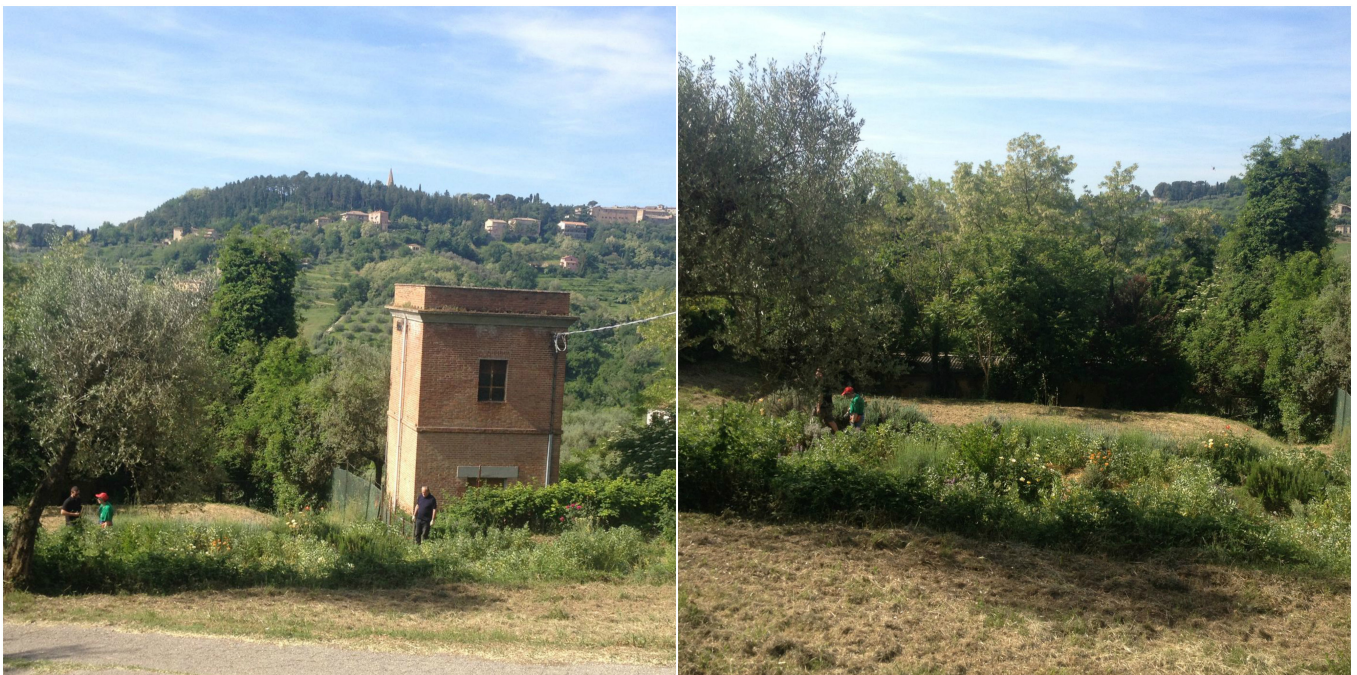
Figure 3: The project of Therapeutic garden in Santa Margherita Park

The San Matteo Garden is located in the district of Sant'Angelo within the San Matteo degli Armeni complex. The monastic complex became a suburban residence of the Oddi family in 1632, then returned to the possession of the Cathedral in 1820. In the 1960s the site was purchased by the Company of Perugia Tourism as a location for the regional ethnographic museum. The Association "Vivi il Borgo", who promoted this project, commenced looking for a site on which to create their community garden in 2013. Discussions were held with the municipality regarding an area of 7000 m 2 within the San Matteo Armeni complex, and the garden was inaugurated in November 2015. The municipality, within the framework of the OrtiUrbani 3 project, supported this initiative. The Association signed an agreement granting the use of the space and defined rules for the organisation and management the garden. The main objectives of this garden are food production and social integration.