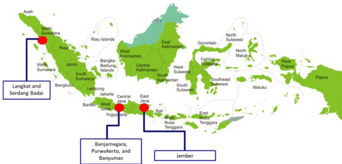
Figure 1: The map of GIZ project locations in Indonesia

Another example of the introduced program is crop insurance. This program is one of the government programs to support farmers to adapt with climate disasters (MoA Regulation No. 40 / Permentan / SR.230 / 07 / 2015 on Facilitation of Crop Insurance). In general, the main objective of this program is to increase farmers' resilience towards climate change. Crop insurance helps farmers in reducing risks to climate change impacts, increasing farmer's income, ensuring available costs for production inputs, as well as availability of working capital. The GoI through MoA supports the execution of crop insurance through a numbers of pilot projects, in cooperation with an insurance company named JASINDO. For the pilot studies, the insurance premium was subsidized about 80% so that farmers pay lower premium (BB Padi, 2015). Additionally, farmers must comply with the insurance requirements, such as paying premiums on time. However, it was found based on a case study in the North Sumatera and East Java that the capacitated staff of JASINDO, who should do the risk assessment, was not widely available (GIZ, 2017a). Understanding the challenges, stakeholders' involvement to build comprehensive and reliable information is important foundation to pass the challenges. The engagement of multi-stakeholders to accelerate farmers' adoption on recommended SR actions should also be proposed and institutionalized.