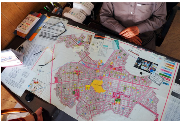
Figure 4. Picture of a real-estate map of DHAs Phases 1 to 5 surrounding Charrar Pind.

Similar to Charrar Pind, other peri-urban villages are affected by the pace of current land transformation. As the DHA claims more land for the newest housing phases, it continues to engulf villages, further augmenting the urban land under the military’s control (see Figure 6). Here, the ‘gated’ or ‘secluded’ communities are not—as one might expect—the exclusionary housing schemes, but rather the pre-existing villages. Partially fenced-off by concrete walls built by the DHA authorities, ramparts mark the limit between the territories of the original settlements and the already,