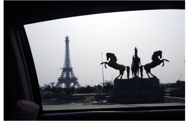
Figure 3. Bahria Town Lahore world-class style and foreign imaginaries. Photograph taken during a ride-along with a real-estate broker, 2015.

The emergence and de/reterritorialization of Bahria Town over the years evidences the unequal power relationships between the private developer and residents of pre-existing villages, who ultimately lost access to, and control over, their property. The bundles of power and access mechanisms—mostly illicit and relational based—deployed by the private developer outpowered those of the villagers, despite their (legal) rights-based, affective, and moral claims to the land. The mecha-