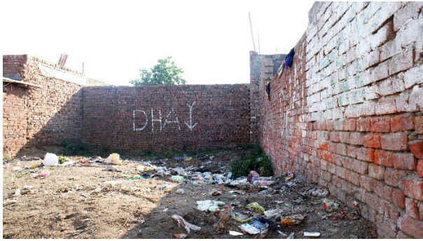
Figure 7. Plot sold to DHA in a peri-urban village, 2015.