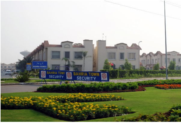
Figure 2. Security checkpoint within Bahria Town Lahore, 2015.