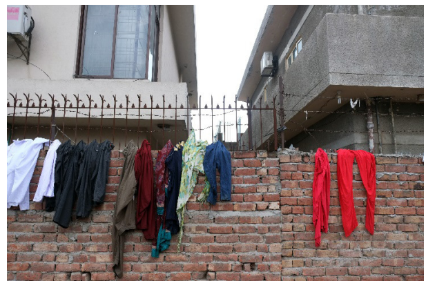
Figure 5. Wall separating DHA houses (behind) from Charrar Pind, 2015.