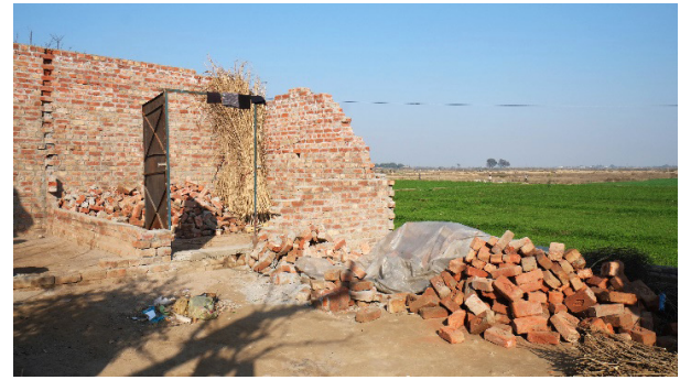
Figure 8. Deconstructed house on the edge of a village under contention with DHA, 2015.

attributed to aesthetics rather than ethics in planning interventions (Ballard, 2012; Bauman, 2005), trumping legal and ethical concerns (Rizvi, 2019).