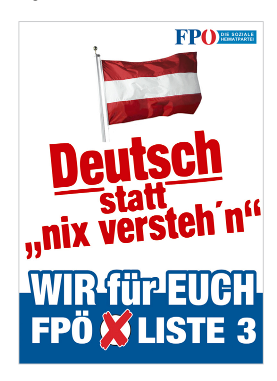
Figure 2: Election Poster 2010