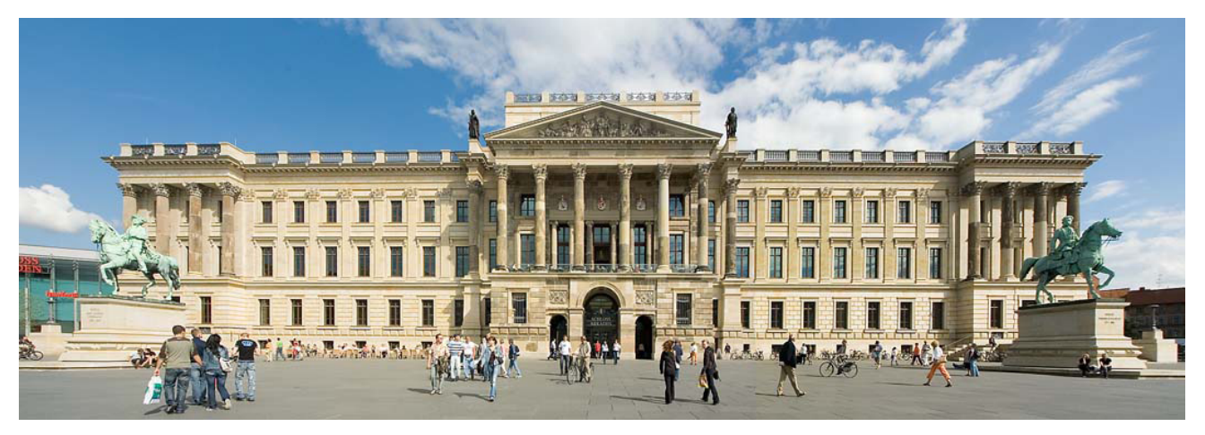
Figure 3. Reconstructed Braunschweig Palace.

When local activists advocate reconstruction strongly, this does not always shake the convictions of local