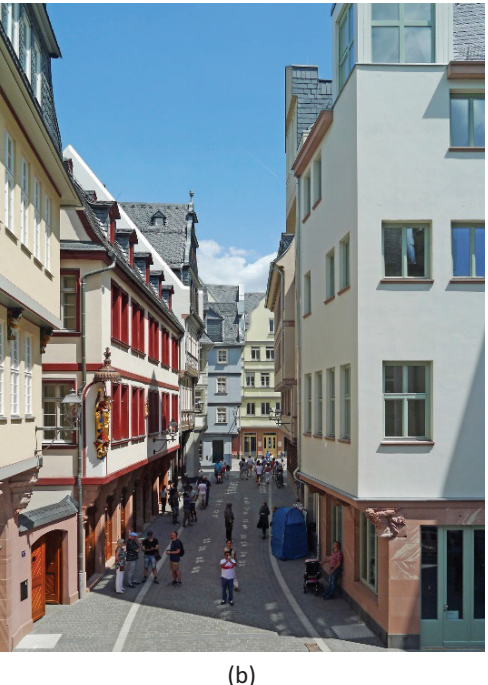
Figure 5. Technical City Hall (a) and part of the reconstructed old town (b).