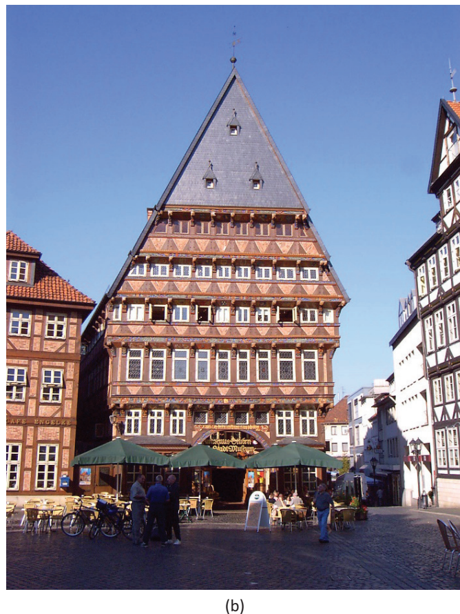
Figure 2. Hotel, 1962 (a) and reconstructed Knochenhaueramtshaus (b).

of moving traffic allowed for a better urban integration of the parking garages concentrated on site. ECE offered to integrate parts of the palace salvaged during demolition into an elaborate copy of the historic palace façade (Figure 3). Despite opposition from retailers fearing new competition, a citizens' initiative campaigning for the preservation of the palace park, and national criticism of the associated "Disneyfication," that is, the physical simulation of a glorious past by rebuilding a spectacular