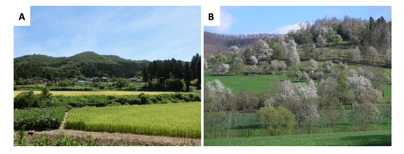
Fig. 1 Examples of socio-ecological production landscapes and seascapes. A Satoyama landscape, B German orchard meadow

SEPLS case studies are publicly available as structured reports on the IPSI website (IPSI 2021). Based on the availability as well as the agreement on sharing the contact information, focal points from 139 of the initially contacted 229 SEPLS cases were invited to the Q-method survey for this research. Focal points for each of the SEPLS cases were single individuals who represented at least one of the member organizations, and who had deep knowledge and firsthand personal experience in the landscape approach implemented. We included only those SEPLS case studies that