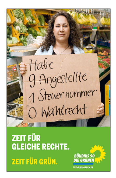
Figure 1: Local Election Campaign Poster, Green Party, Essen The campaign poster reads: "I have 9 employees, 1 tax number, 0 voting rights." The poster then says, "Time for equal rights. Time for Green" (Bündnis 90/ Die Grünen, 2009).

In both cities, Essen and Newark, interviewees imply a common identity as migrants, based on the migration experience and on the feeling of discrimination ( Libanesischer Zedernverein , interview, Aug. 5, 2009; Türkische Gemeinde Rhein Ruhr , interview, Aug. 21, 2009). In the Newark case, there are claims by organizers that documented immigrants