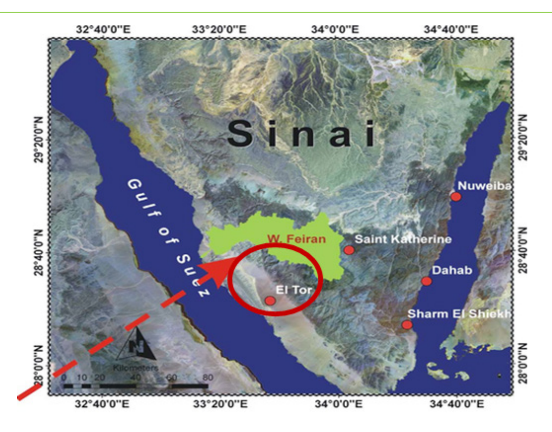
Figure 1: South Sinai, Egypt (left) and the research area (right)

len, 2002). Many models based on meteorological data have already been developed to estimate ETo in various climatic and geographic conditions. Among these models, Penman–Monteith FAO 56 (PM) was introduced as a standard model to estimate ETo (Allen et al., 1998). The major limitation of the PM model is that it requires many meteorological inputs, thereby limiting its utility in data-sparse areas. Therefore, the application of simpler models is recommended because they only need parameters that are readily available from station-observed meteorological data.